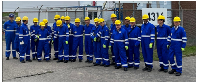
Live demonstration of decarbonization by Vopak

Noteworthy highlights of the trip included an exclusive invitation to the prestigious Rotterdam Red Carpet annual event, a special luncheon with the Singaporean ambassador to The Netherlands and representatives from select Dutch organizations, a customized presentation on the Port of Rotterdam's decarbonization strategy aboard the 'De Nieuwe Maze' boat, and a visit to the Vopak site, where a live demonstration of one of their decarbonization initiatives took place.