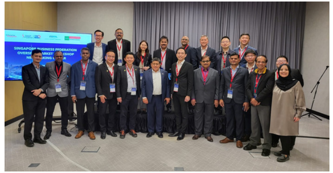
Group photo taken during Rotterdam Conference

In collaboration with the Singapore Business Federation (SBF), ASPRI successfully revitalized its overseas business trip initiatives in the fourth quarter of 2022, focusing on Rotterdam and the UAE in October and November respectively.