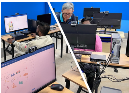
Mettl Test, AI Proctoring