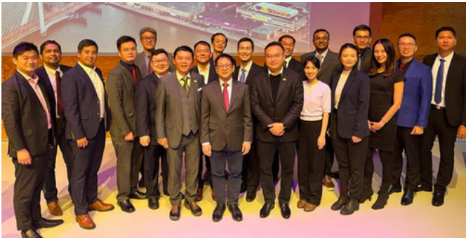
Group photo taken for the UAE Mission Trip