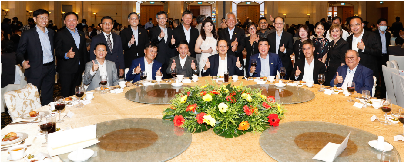
Group photo taken during Gala Dinner

Welcoming a Change of Guard and Celebrating 25 Years of Achievements while Embracing the Future.