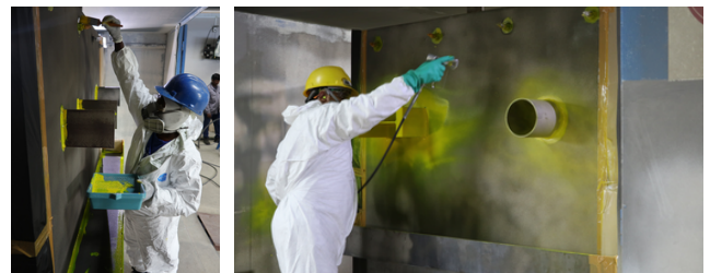
Students doing C12 Painting and Blasting Works