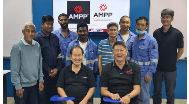
First class of C12

The inaugural class held in March '23 marked a significant milestone, further cementing ASPRI-IPI's unwavering commitment to delivering top-notch certifications. The successful completion of this class showcased the effectiveness and quality of their training programs. In addition, ASPRI-IPI is now gearing up for our 5th edition of the Coating Inspector Programmes (CIP).