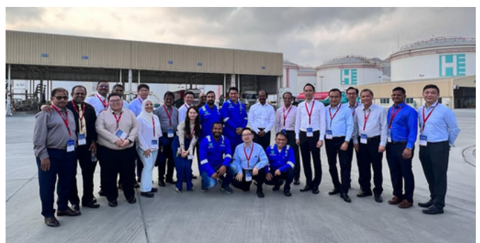
Site Visit at Horizon Terminal UAE

In the UAE, ASPRI's 17 participants, representing 15 companies, had the opportunity to extensively network and explore the business landscape in the region.