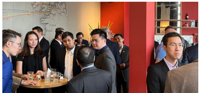
Special Luncheon with Singapore Ambassador