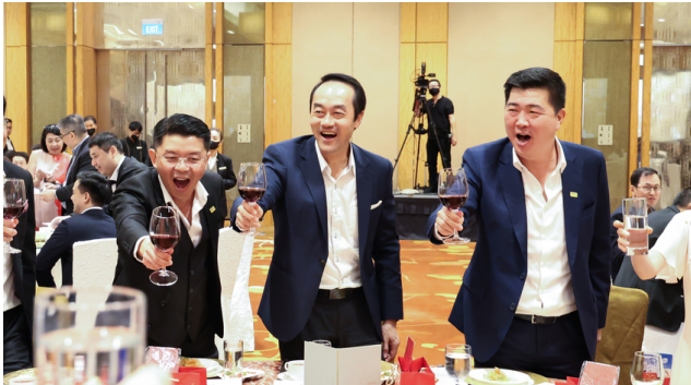
ASPRI Lohei 2023 - A toast at the VIP table

On February 3, 2023, ASPRI organized its Process Industry Prosperity Lohei 2023 at Marina Bay Sands. This annual flagship event marked a significant milestone as it was the first event held in three years since the COVID-19 pandemic. The Guest-of-Honour, Dr. Koh Poh Koon, Senior Minister of State for the Ministry of Manpower and the Ministry of Sustainability and the Environment, graced the occasion. The evening brought together more than 550 guests, including government and industry partners, as well as esteemed members from the Process Industry.