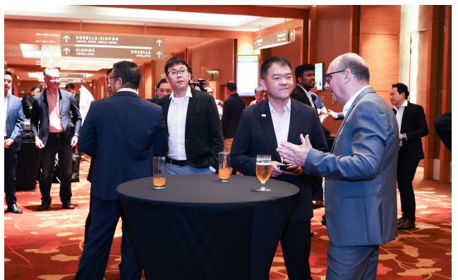
Participants hanging out at the reception area

ASPRI extends its heartfelt appreciation to all distinguished guests, members, and generous sponsors for their unwavering support, which contributed to the resounding success of the dinner.