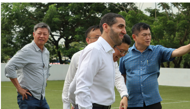
Hosted by the UAE representatives