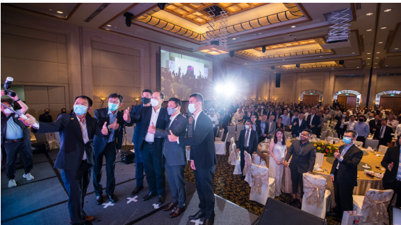
Group photo taken during Gala Dinner after DRI launch

During the Gala Dinner, ASPRI unveiled its new tagline, encapsulating the organization's aspirations for the future. The tagline emphasizes ASPRI's commitment to promoting environmentally friendly practices, energy efficiency, and the reduction of the carbon footprint across the process industry. Through collaborative efforts and innovative solutions, ASPRI aims to drive sustainable growth and address the global challenges faced by the industry.