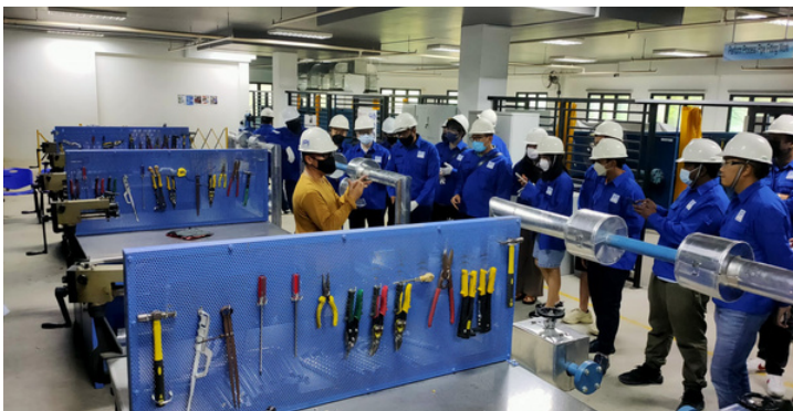
NUS Masterclass Orientation