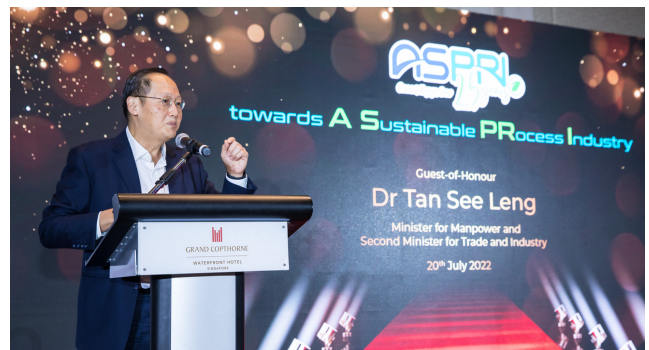
Minister for Manpower and Second Minister for Trade and Industry, Dr. Tan See Leng giving his speech

This grand event brought together over 600 industry leaders, government and private sector partners, and esteemed guests from the process industry. Alongside the anniversary celebrations, the Gala Dinner witnessed the unveiling of ASPRI's new tagline, "Towards a Sustainable Process Industry," reflecting the organization's commitment to fostering environmental stewardship. Furthermore, ASPRI introduced the highly anticipated Process Construction and Maintenance (PCM) Digitalisation Readiness Index (DRI), further highlighting their dedication to driving innovation and digital transformation within the industry.