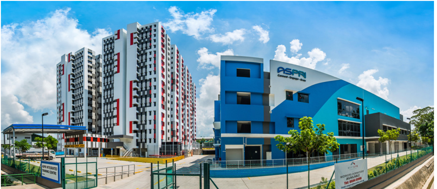
ASPRI Integrated Centre (AITC)

In FY22/23, AITC has held 24 visits for various government bodies, institutes and companies.